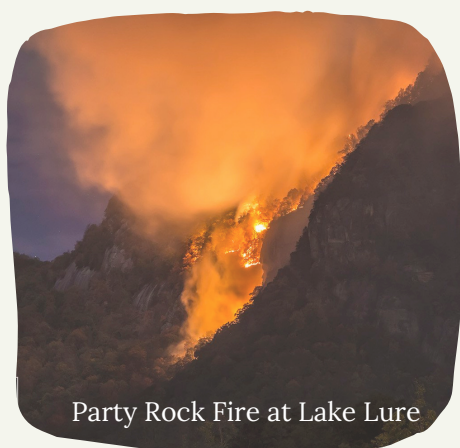
Party Rock Fire at Lake Lure

Recurrent severe droughts have wildfire managers, community leaders, and residents concerned that significant wildfire risk will grow more prevalent for the Appalachian Mountains and the people who live there.